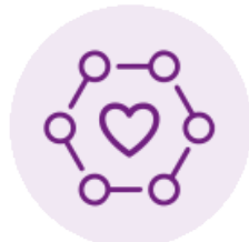
Working better together