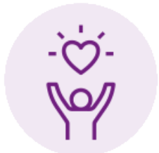
Prevention and early help