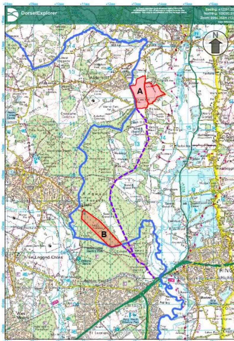
Figure 1 – Proposed Allocations Adjacent to Dorset